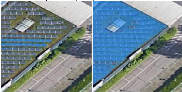
a. Points prompt b. Boxes prompt Fig. 1 Using SAM to segment PV panels

Given the notable transferability and dataset independence of the SAM, we considered employing the SAM framework for our study. However, when directly applied to PV panel image segmentation, the SAM model faces limitations due to a lack of relevant pre-trained data and semantic labels, which means insufficient adjustments and optimizations for specific and complex image contents. As shown in Figure 1, even with the use of bounding points(a) and boxes(b) prompts, the model fails to correctly identify PV panels.