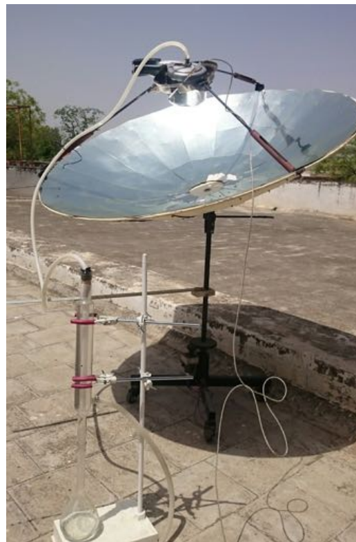
Fig. 1: Dish solar concentrator and experimental set-up

temperature ( T_a ), wind speed etc.) are measured by weather station (Virtual pvt. Ltd) installed at SERL.